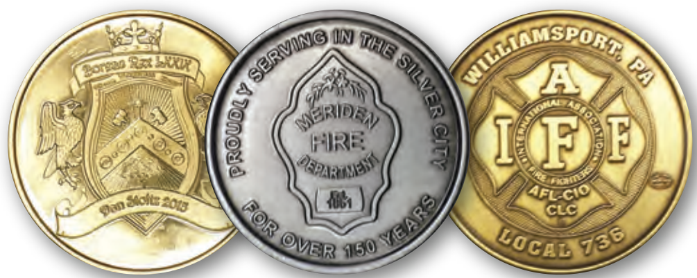
BRIGHT BRONZE NICODIUM® ANTIQUE BRONZE